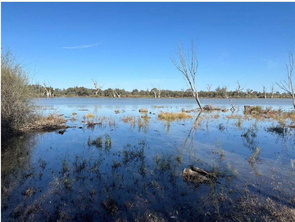
Picture 2: Duck Hole wetland inundated through operation of the Pike regulator and delivery of water for the environment in September 2024.