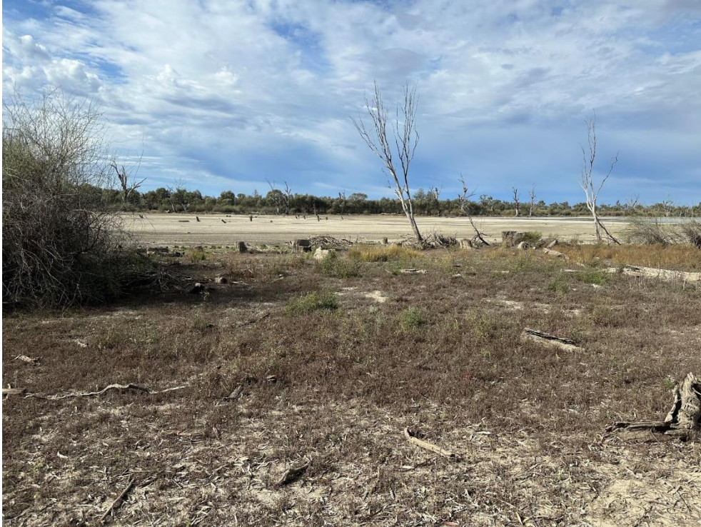
Picture 1: Duck Hole wetland in August 2024.

Check out the recent inundation of Duck Hole wetland.